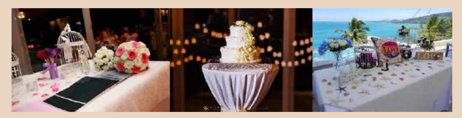
VENUE (wet weather back up venue, standard AV system will be provided)