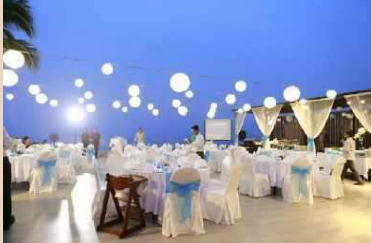
For 40 persons and below: Wedding Lawn at Vanilla Sky Bar